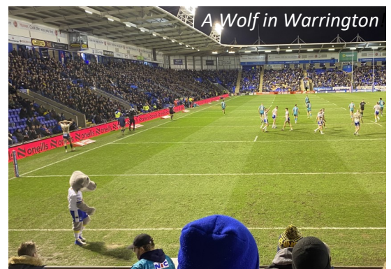
A Wolf in Warrington

It's the smallest UK bird, along with the firecrest. Their thin beak is ideally suited for picking insects out from between pine needles. Seen all year round, it takes more than 2,000 goldcrests to weigh the same as the UK's heaviest wild bird, the mute swan.