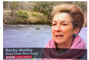
Straight Talk about the Wharfe

Water quality campaign groups - frustrated that the public who pay for both the water companies and