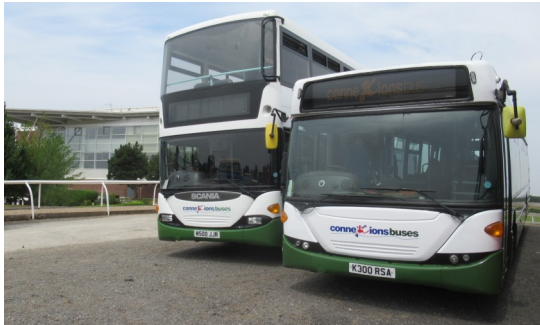
Can run buses to racecourse and for new contract in Otley but not on 2 of their services on Saturdays from Wetherby