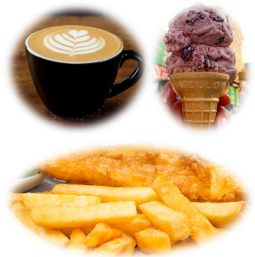
Food & Drink that are already well catered for by local businesses