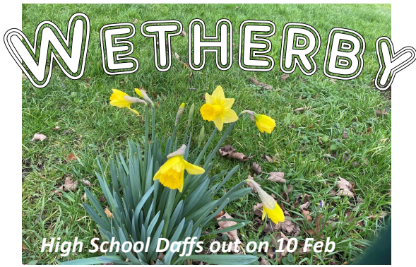
High School Daffs out on 10 Feb