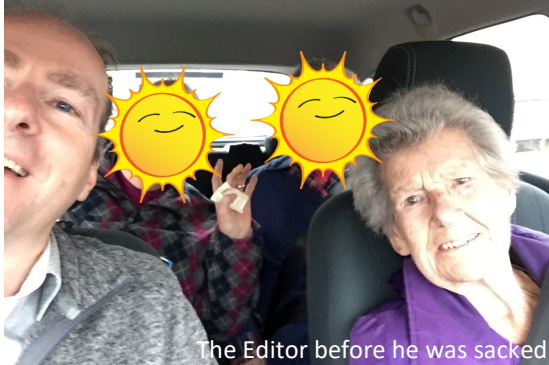
The Editor before he was sacked

Soon after, I was sacked as a (popular) volunteer driver because of this issue. It is clear that a manager with a strong personality, who has shown such poor judgement, needs close monitoring by Trustees.