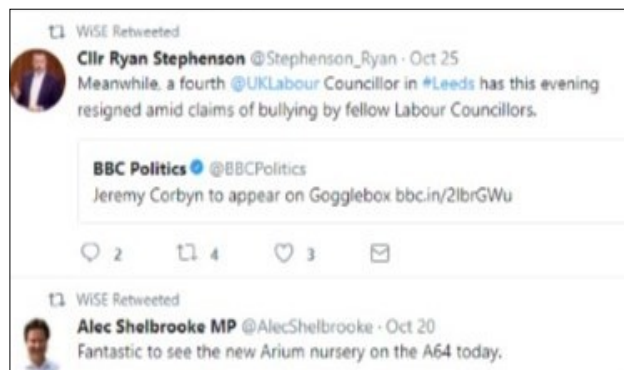
WISE Twitter account used for political purposes in 2017. No newspapers reported it

Another 8-Page Issue! Read it online at www.pkmarketing1.com/wetherby-free-press