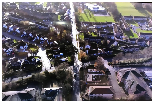
Unusual drone shot of Hallfield Lane/York Lane X-roads We can see our house. Can you see yours?