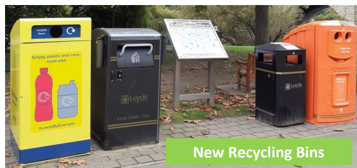
New Recycling Bins

New orange and yellow 'on-the-go' recycling bins mean that we'll now be able to recycle cups, cans and plastic bottles.