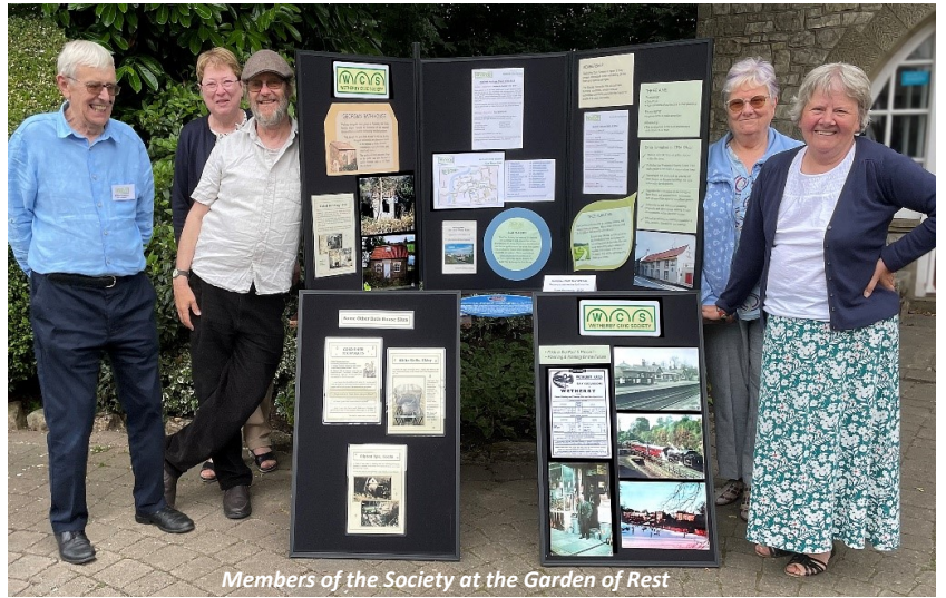
Members of the Society at the Garden of Rest