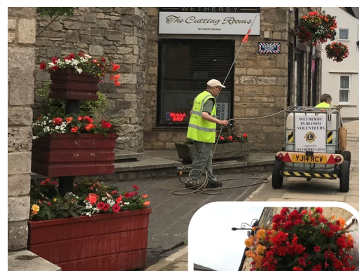
Waterers near the library