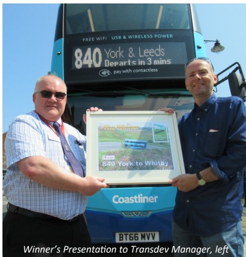
Winner's Presentation to Transdev Manager, left

Scenic Bus Route' a few years ago. It runs over the glorious North York Moors with double-deckers. The survey was organised by the Editor and his business, PK Marketing (see @mostscenicbus on Twitter). It featured in many daily papers, including The Times and The Mirror , as well as many online news outlets, like Mail Online . But the largest publicity was from national BBC News who sent a camera