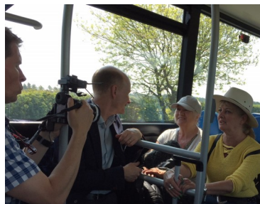
BBC News reporter Simon Gompertz

Such a route like this should not be at risk. Everything should be done to get people out of cars, especially in our treasured National Parks. Many Wetherby residents enjoy this scenic bus trip across the Moors, so let's hope it is saved for everyone's sake. The more that we 'Use it', the less likely we 'Lose it'. It is free for passholders and only £2 per single ticket from 1 Jan to 31 March.