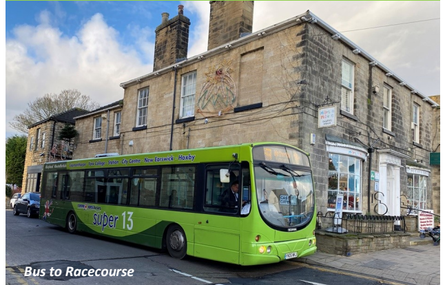
Bus to Racecourse

Direct travel to York & Otley has not been possible on Saturdays since May 2022, 7 months ago. This has meant no buses at all at the weekend to these places. We were told it was because of driver shortages but we have noticed Connexions do have enough drivers to run the free service to the racecourse on race-days.