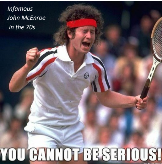
Infamous John McEnroe in the 70s

The Wetherby Free Press knew this was coming. The Councillors are clearly fed up of the WFP telling everyone the truth and giving residents the facts, with a dose of common sense opinion. They would prefer to pay a 'Communications Manager' to promote the councillors and their work. Just like many other public organisations, including the Mayor of West Yorkshire & local charity WISE, they prefer to spend our public money on PR than actual services.