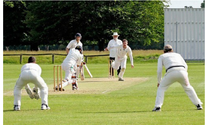
Final Over at Wetherby

Locally, Collingham and Linton C.C. has 3 senior teams in Aire/Wharfe Senior league as well as juniors in U9 to U15 leagues (Aire/Wharfe and Leeds/Wetherby leagues). Thorp Arch and Boston Spa has 2 senior teams in York Senior League as well as juniors in the Leeds /Wetherby League. Kirk Deighton run 2 teams in the Nidderdale League as does Spofforth who also have