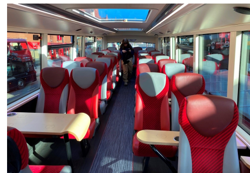
Luxurious interior praised by many