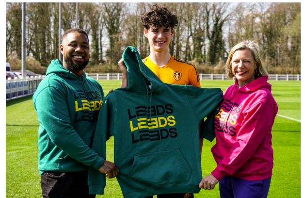
Leeds player Archie Gray in the middle