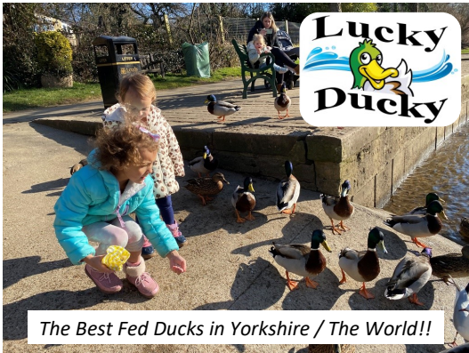
The Best Fed Ducks in Yorkshire / The World!!