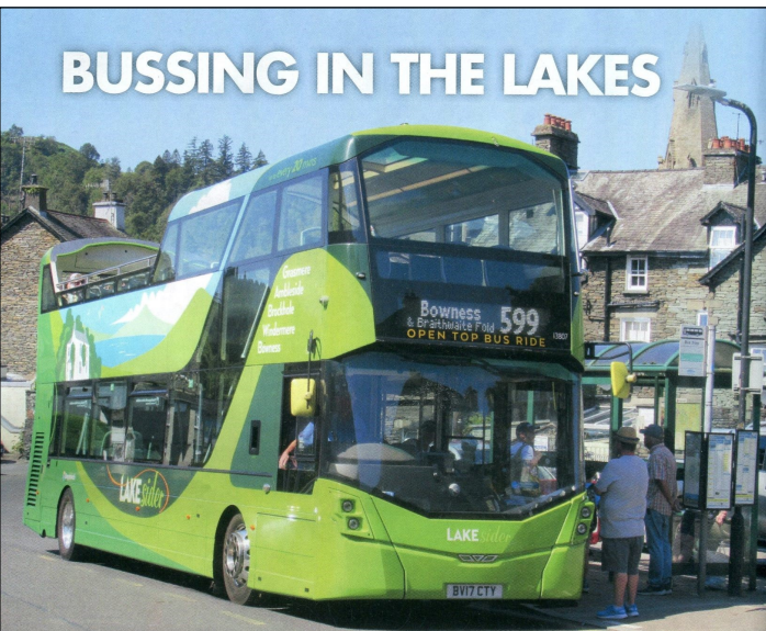
Is the superb scenery in the Lake District matched by superb services by Stagecoach? PAUL KIRBY found out during a 10-day holiday in Summer 2022