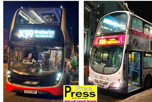
Fancier buses but is Transdev more reliable than First?