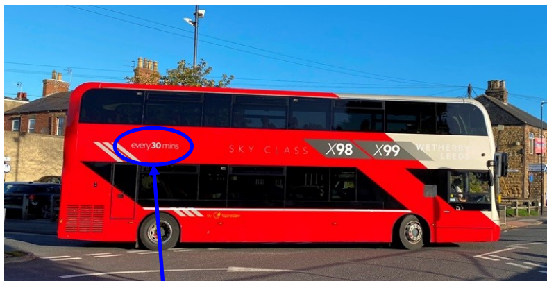
'Every 30 minutes' - Let's hope it stays that way

One that we can all agree on is "I am hoping this improvement will continue because it is exactly what we need - a reliable and regular bus service to get people out of their cars". Here, here.