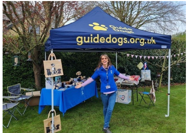
Bodhi's owner who also sold the sweepstake tickets

Editor's note - This is a charity well worth supporting as they do not waste money on expensive 'communications' staff. This item of news was sent to us by a 'Volunteer Media Assistant'. Anyone with half a brain can write a simple press release and take a photo. Remember many charities, including local ones, spend our/your money on themselves instead of the cause - see Issue 29.