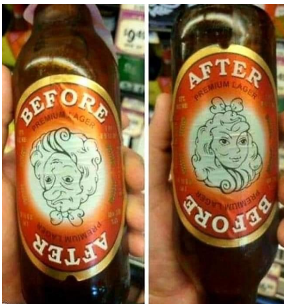
Yes, it is the same picture!

What's the best part about living in Switzerland? I don't know, but the flag is a big plus.