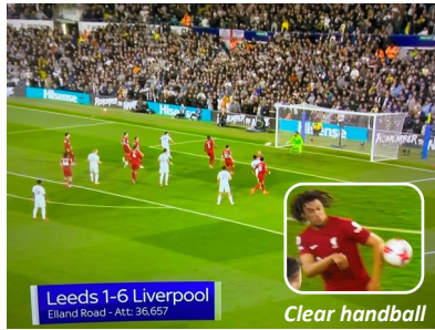
Leeds early chance saved

Their next opponents were Liverpool; inconsistent this season and against United. Leeds had an early chance but it remained goalless until the 35th minute when the Reds scored after a clear handball. Salah made it 2 - 0 but Leeds were given hope by a dreadful defensive error and Sinisterra got the Whites only goal. Fans started heading for the exit after the Scouse team's fifth goal. This bad defeat leaves Leeds fifth from bottom, 2 points above the relegation zone. Nail-biting times ahead!