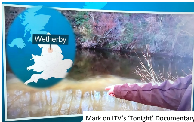
Mark on ITV's 'Tonight' Documentary

Sadly, England's waterways are facing their biggest fight to date against pollution caused by sewage, agriculture, chemicals and plastics. When we should be striving to move forwards, we are going backwards. In 2020 water firms discharged untreated sewage into waterways 400,000 times which equates to over 3 million hours of untreated sewage and that figure will rise in 2021. Only 14% of England's rivers meet good ecological .