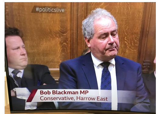
PMQs on 20 Oct (Wednesdays at 12.00)

We asked Alec what he thinks of the new bus stop flags in Wetherby, compared to the old. And Metro/WYCAS performance in putting them up - See Issue 2 for details.