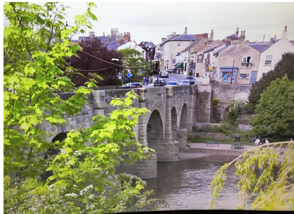
One of the many great shots of Wetherby in each program