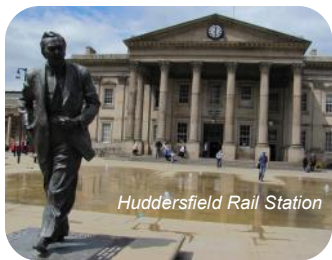
Huddersfield Rail Station