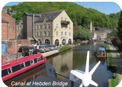
Canal at Hebden Bridge